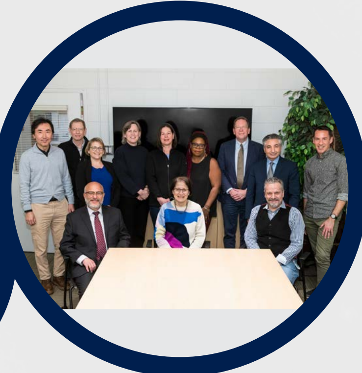
THE LMP VICE CHAIR COUNCIL 2023