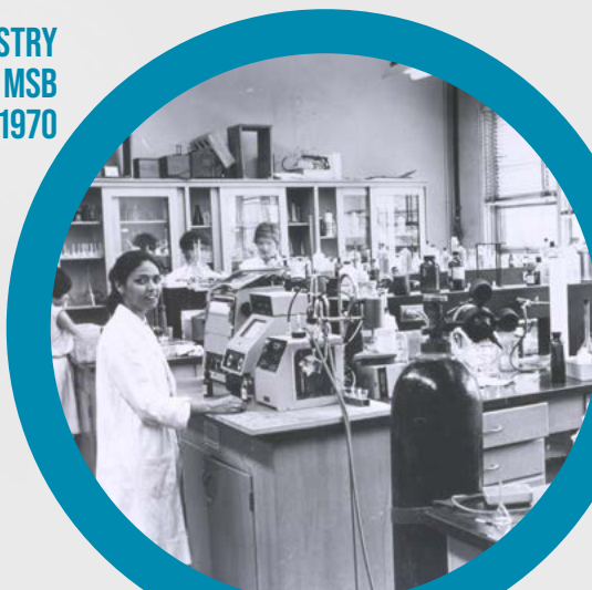
A BIOCHEMISTRY LAB IN MSB CIRCA 1970

The Department of Bacteriology changes its name to the "Department of Medical Microbiology".