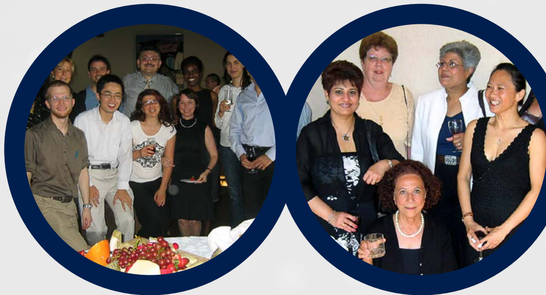
THE ADMIN TEAM, CIRCA 2007