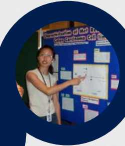
A SUMMER STUDENT PRESENTS HER RESEARCH, 2003

Several faculty members fall ill with the SARS virus while treating patients.