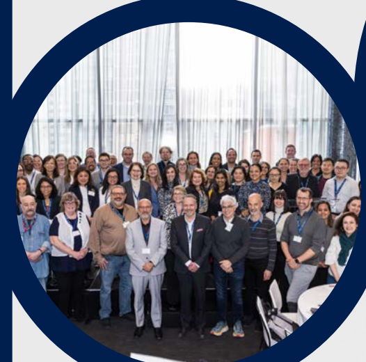
THE LMP FACULTY DEVELOPMENT DAY 2023