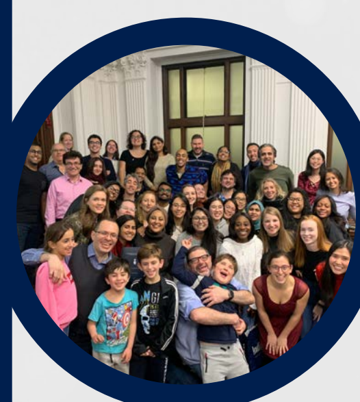
THE TRP WITH FRIENDS AND FAMILY