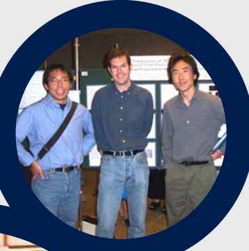
LMP FACULTY AT THE SUMMER STUDENTS POSTER PRESENTATIONS IN 2002

The first LMP Graduate Students Day is held and later that year, the LMP Residents Research Day. (These have now merged to form the LMP Research Day [LMPRC]).