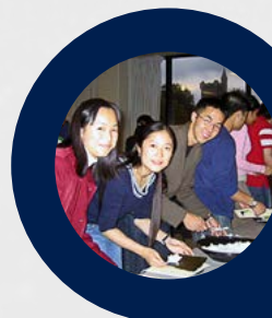
UNDERGRADUATE STUDENTS AT THE LMP SUSHI NIGHT